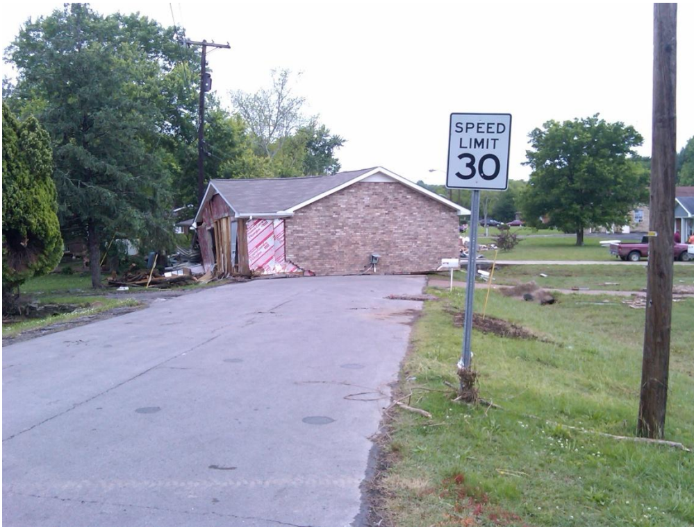
May Flooding in Nashville